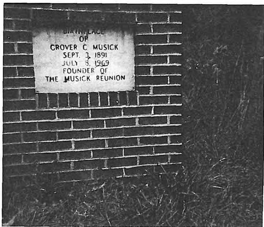
This marker is alongside of State Route 615, on Weaver Creek, in Russell Cy., VA.