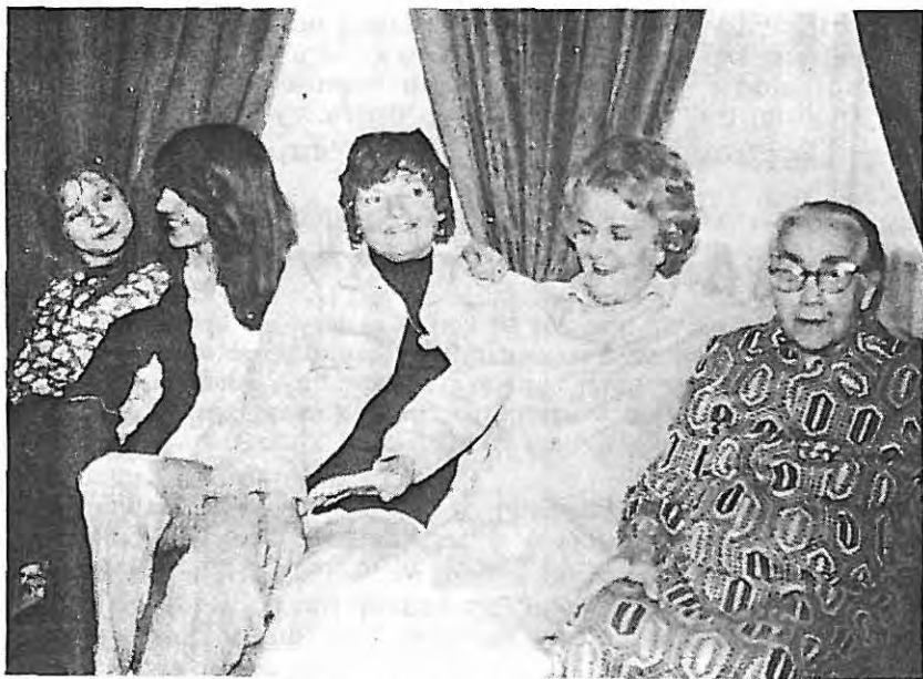
Five Generations of Musicks